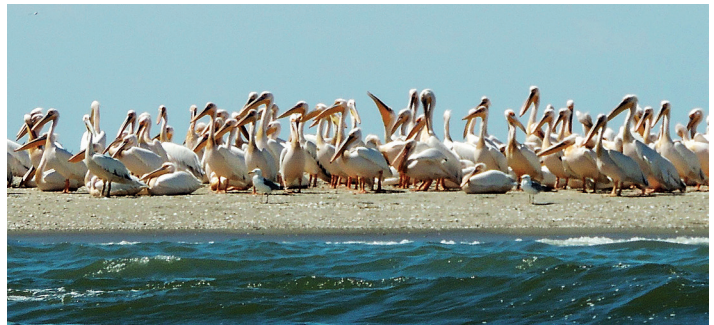
Impressions from IAD conferences and excursions and venues of the 42 IAD conferences.