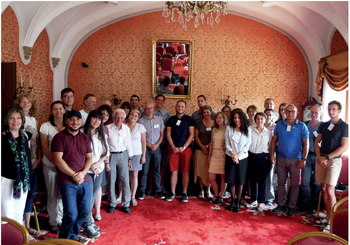
42 nd IAD-conference in Smolenice, Slovakia.