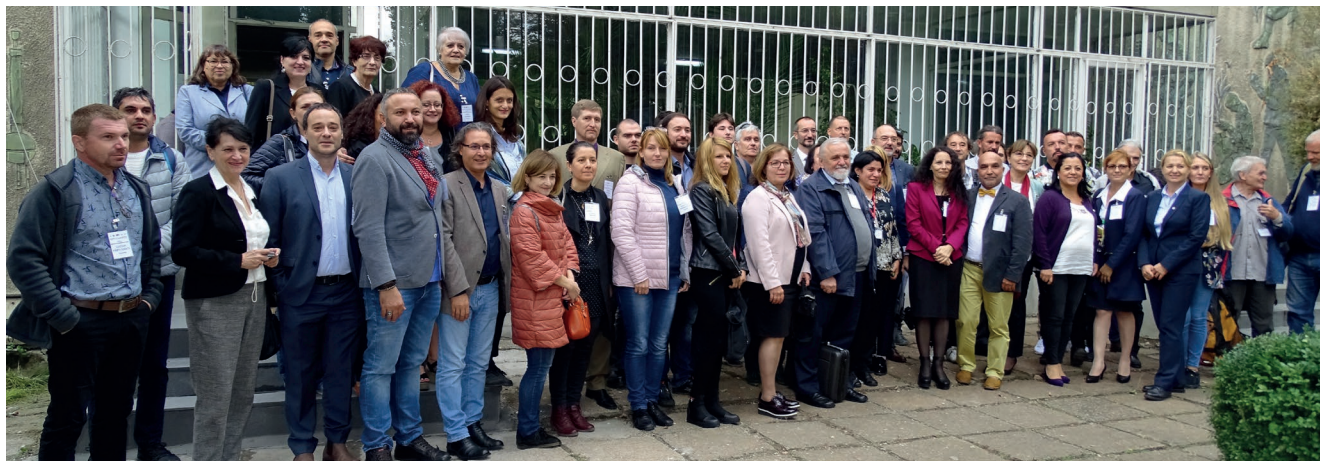
Figure 1. Group photo of the participants of the Joint ESENIAS and DIAS Scientific Conference

The Danube Region Invasive Alien Species Network (DIAS) was presented in the conference introductory key-note lecture with its mission, recent activities and achievements. This lecture focused also on the DIAS data sources, including recent projects, types of data collected and future