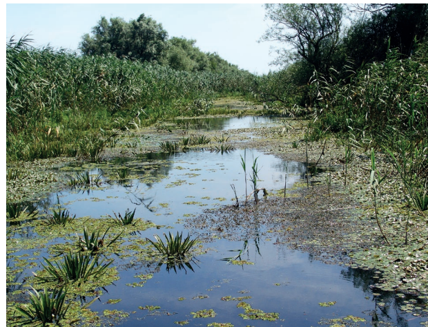
Figure 2. Dense and species-rich aquatic plant growth in a long and narrow channel of the Danube Delta

The authors, the editors and ACADEMIA Publishing House look forward to a friendly reception of this book,