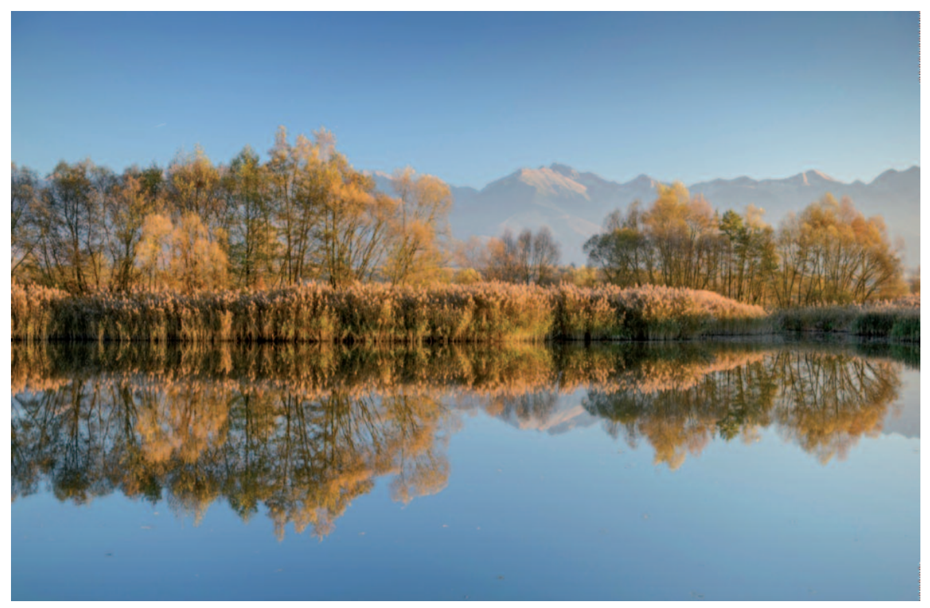
Figure 2: Olt River near the Transylvanian Alps