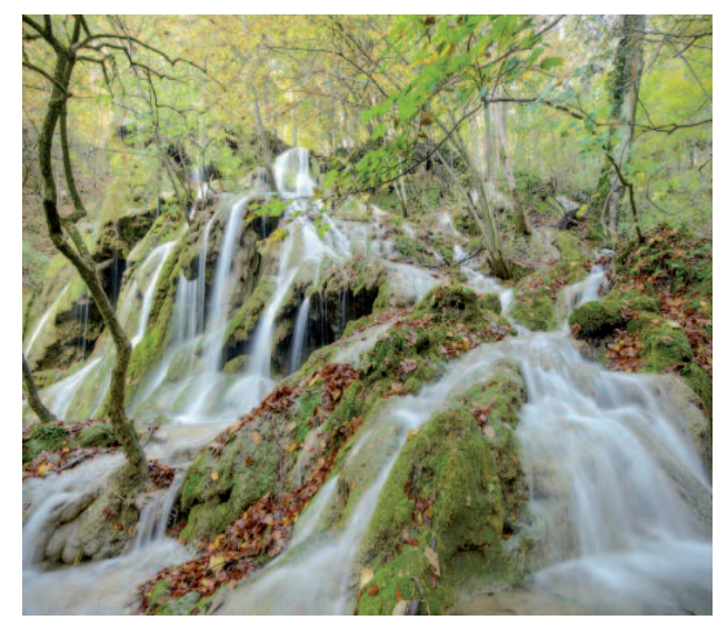
Figure 5: Beuşniţa Waterfall.

As early as 1380, a school was opened serving Sibiu's local and regional intellectual environment, and constitued a landmark for this region. The truth is that the city of Sibiu was permanently motivated by the desire to see its residents