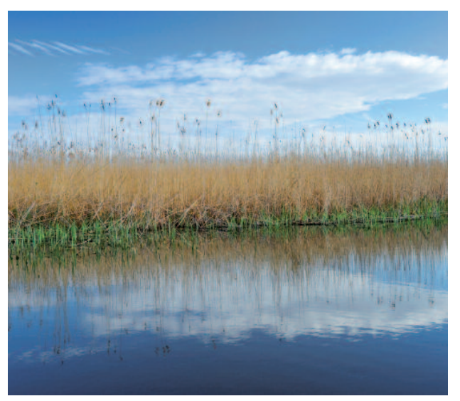
Figure 4: Danube Delta.

Two very fine, large-scale and ancient libraries, the Baron Samuel von Brukenthal Library (http://www.brukenthal museum.ro/biblioteca_en/index.html) and the Library of the Transylvanian Association for Romanian Literature and Culture of the Romanian People (http://www.bjastrasibiu.ro/), induced and sustained a favourable environment for culture and science in the area. The importance of the naturalist tradition of the city appeared and grew continuously since 1849 through several series of scientific international periodicals such as: Verhandlungen und Mitteilungen – in German, Studii si Comunicări - in Romanian, Acta Oecologica Carpatica - in English (http://reviste.ulbsibiu.ro/actaoc/ index.html), Transylvanian Review of Systematic and Ecological Research – in English (http://stiinte.ulbsibiu.ro/trser/ index.html), etc., all of them totally or partially dedicated to the study of the aquatic environment.