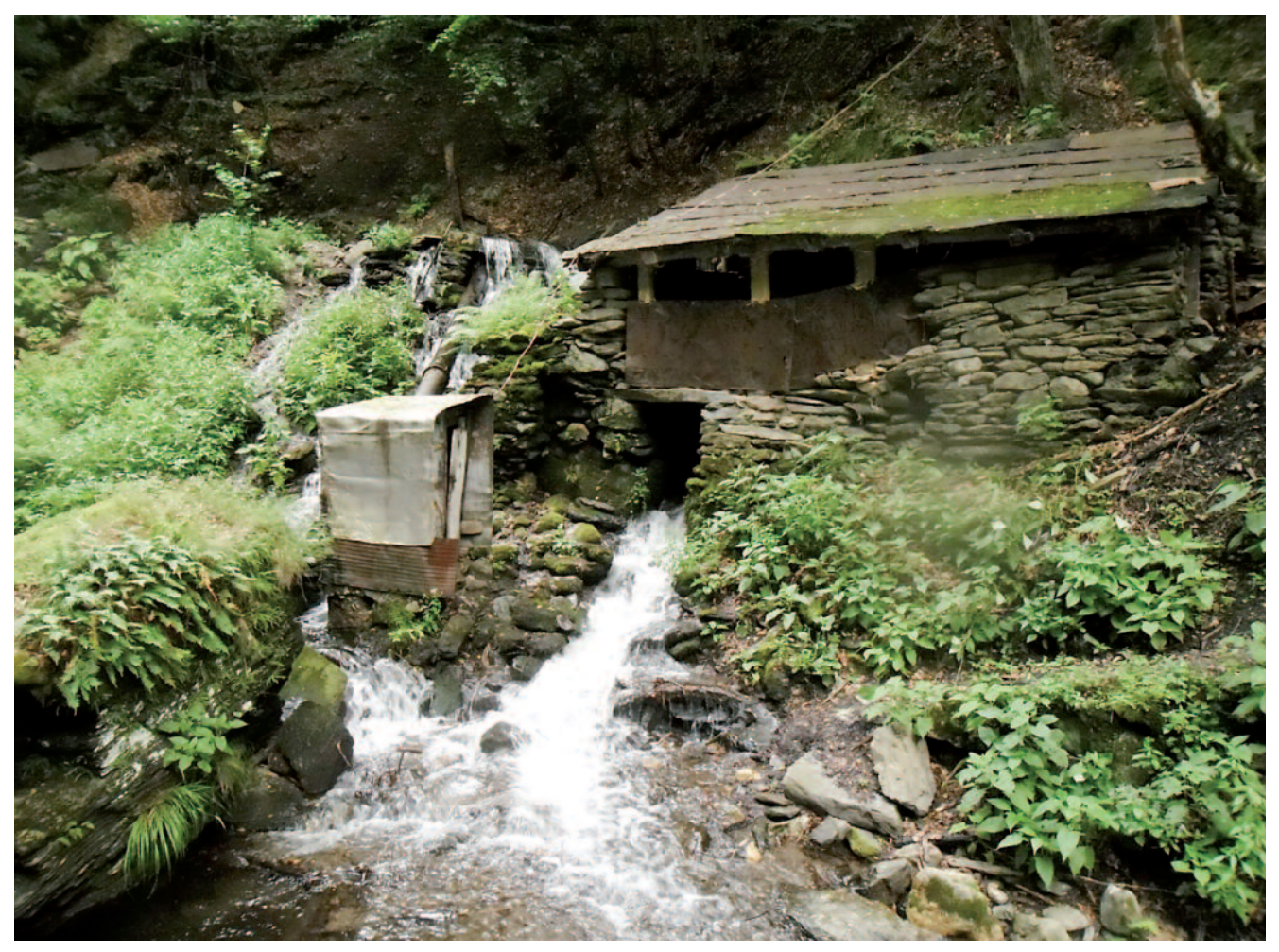
Figure 1: Transylvanian Watermill

One of the results of these enthusiastic nature lovers work was the construction of the present-day Natural History Museum of Sibiu (http://www.brukenthalmuseum.ro/ naturale_en/) in the late 19th Century, an exquisite Italian Renaissance building on three levels which house, conserve and protect natural history collections comprising over one million items of priceless value. The aquatic and semiaquatic species of plants, invertebrates, amphibians, fish and mammals are very well represented and constitute an important continuous attraction for researchers all over the world.